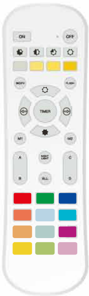
Instruction for Remote Control